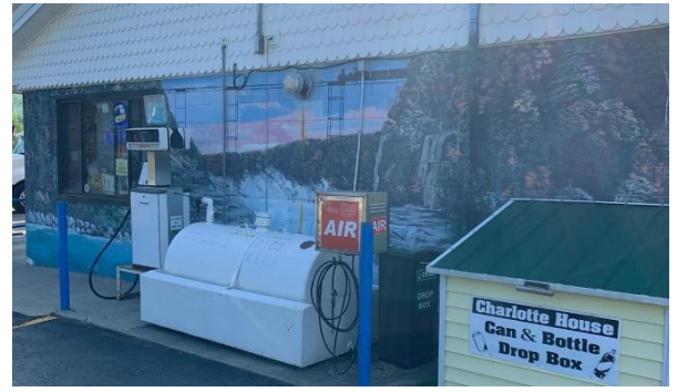
Praller's C & G Store, Varysburg (2)