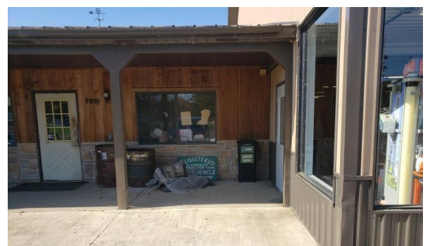
* The Hole Works - Napa Auto Parts, Franklinville (3)