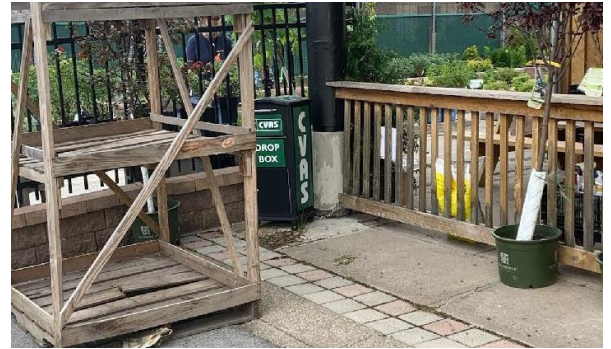
Country Max, Geneseo (4)