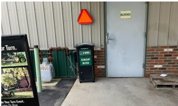
Landpro Equipment, Avon (5)