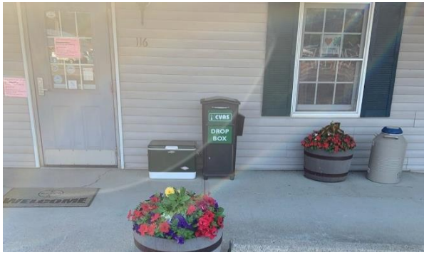
Attica Veterinary Associates, Attica (1)