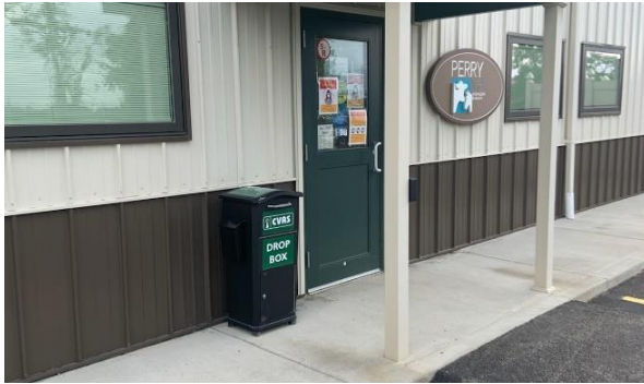
Perry Veterinary Clinic, Perry (3)