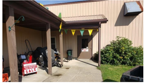
* Landpro Equipment, Clymer (5)