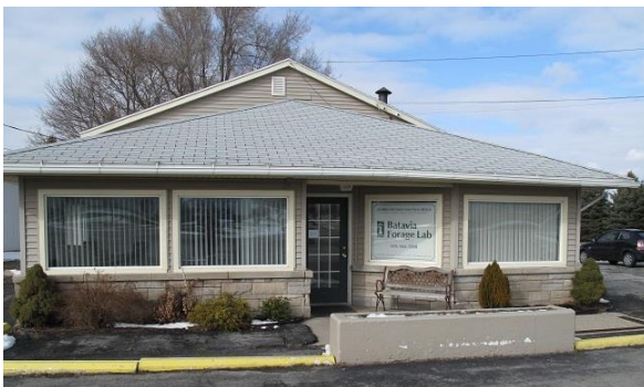
Batavia Forage Lab (CVAS)