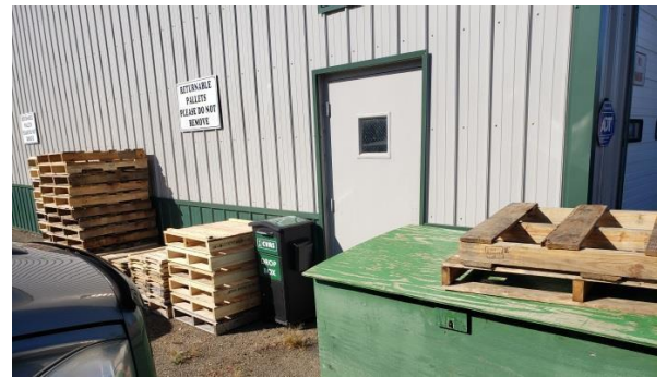
* Landpro Equipment, Springville (1)