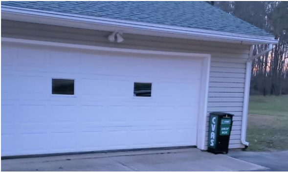
* Western NY Crop Management, Randolph (4)